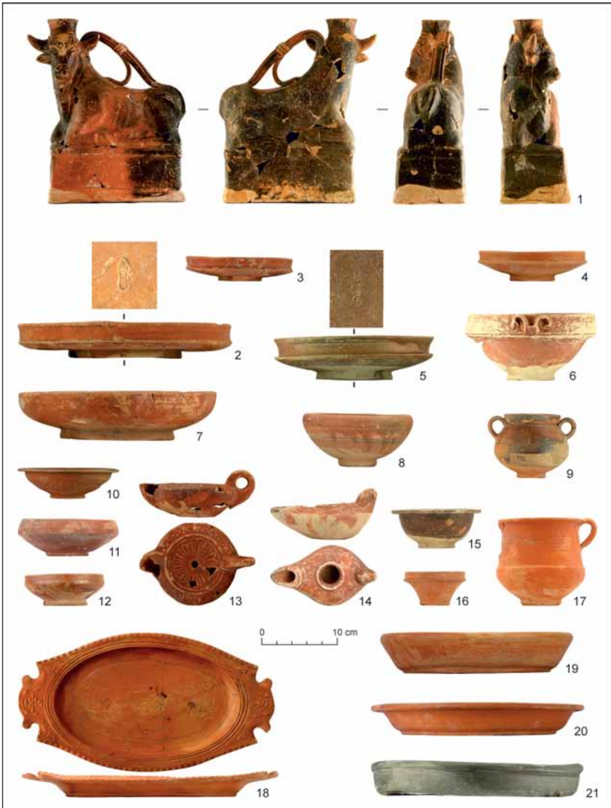
Fig. 5. The cemetery of Frontovoe 3. Red-slip pottery (other varieties) and a wheel-made vessel (21). 1 – grave 317; 2 – grave 320; 3 – grave 260; 4 – grave 227; 5 – grave 316; 6 – grave 304; 7 – grave 292; 8 – grave 304; 9 – grave 278; 10 – grave 52; 11 – grave 104; 12 – grave 104; 13 – grave 323; 14 – grave 136; 15 – grave 297; 16 – grave 276; 17 – grave 111; 18 – grave 125; 19 – grave 137; 20 – grave 41; 21 – grave 314.