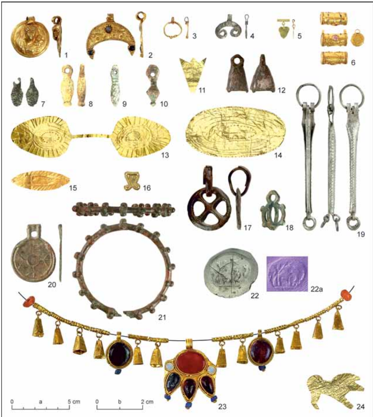
Fig. 9. The cemetery of Frontovoe 3. Pendants, appliques, glass inset and its plaster-cast (22, 22a). 1, 2 – grave 287; 3 – grave 205; 4, 8 – grave 33; 5, 16 – grave 312; 6 – grave 300; 7 – grave 273; 9 – grave 240; 10 – grave 8; 11, 24 – grave 317; 12, 17 – grave 257; 13, 14 – grave 313; 15 – grave 36; 18 – grave 112; 19 – grave 6; 20 – grave 21; 21 – grave 319; 22 – grave 141; 23 – grave 208. Scale: a – 1–21, 23; b – 22, 24.