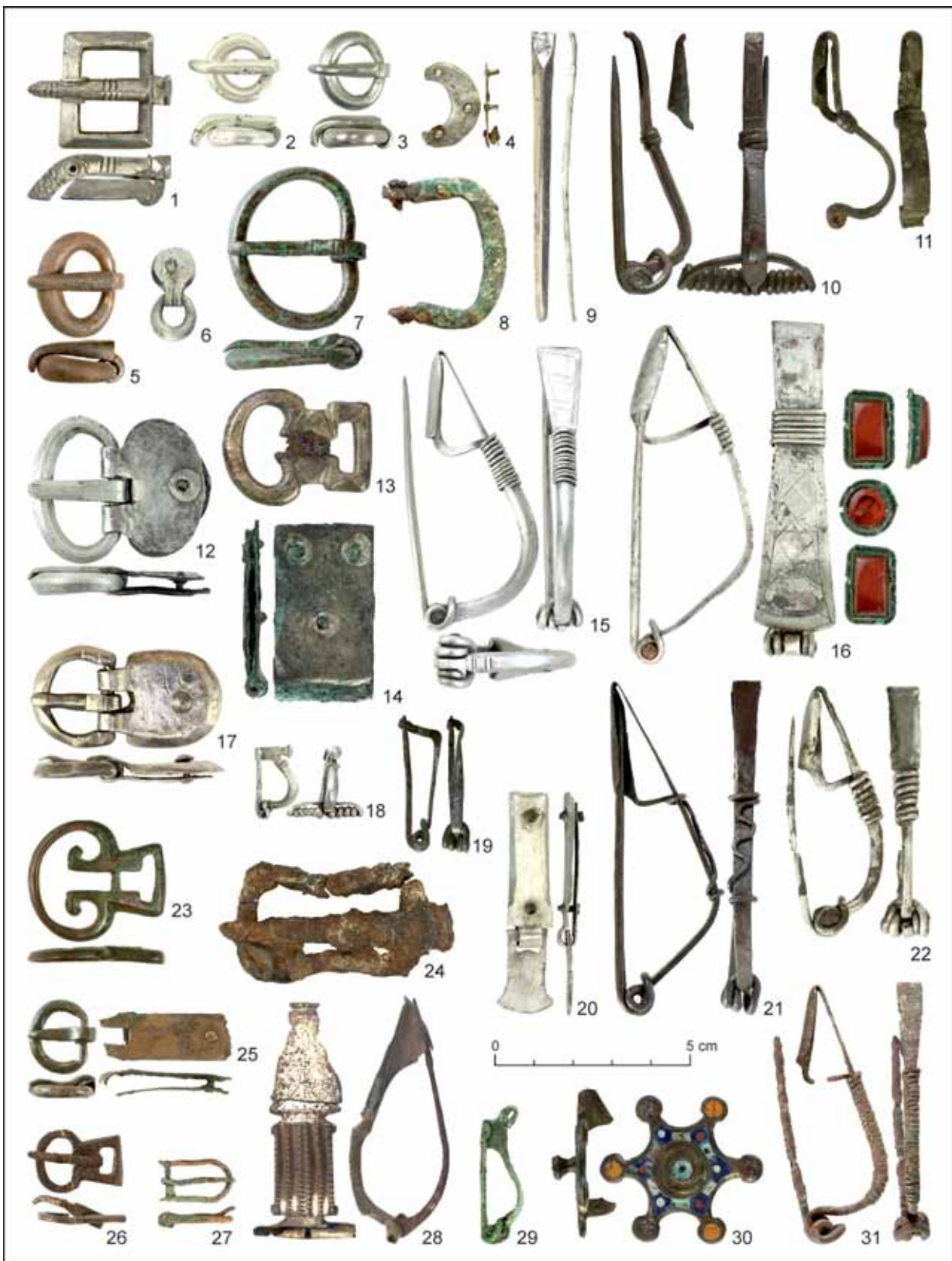
Fig. 11. The cemetery of Frontovoe 3. Brooches, buckles, belt-fittings and strap-ends. 1, 2 – grave 178; 3, 4, 9 – grave 172; 5 – grave 136; 6 – grave 52; 7 – grave 16; 8 – grave 20; 10 – grave 94; 11 – grave 175; 12, 14 – grave 94; 13 – grave 45; 15 – grave 9; 16 – grave 106; 17 – grave 9; 18 – grave 13; 19 – grave 62; 20 – grave 3; 21 – grave 69; 22 – grave 3; 23 – grave 112; 24 – grave 199; 25 – grave 170; 26 – grave 233; 27 – grave 326; 28 – grave 287; 29 – grave 234; 30 – grave 200; 31 – grave 170.