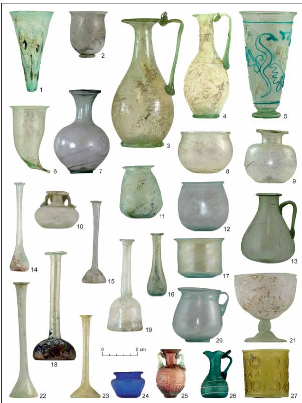
Fig. 7. The cemetery of Frontovoe 3. Glass vessels. 1, 2 – grave 51; 3 – grave 105; 4 – grave 89; 5 – grave 65; 6 – grave 266; 7 – grave 46; 8, 9 – grave 85; 10 – grave 202; 11 – grave 83; 12 – grave 3; 13 – grave 94; 14 – grave 3; 15 – grave 62; 16 – grave 298; 17 – grave 202; 18 – grave 286; 19 – grave 61; 20 – grave 5; 21 – grave 70; 22 – grave 166; 23 – grave 244; 24 – grave 304; 25 – grave 263; 26 – grave 304; 27 – grave 319.