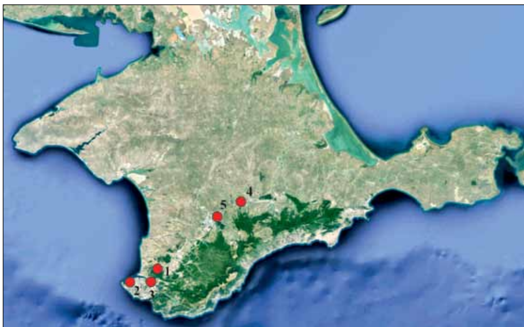
Fig. 1. Crimea. Location of the cemetery of Frontovoe 3 and the most cited sites. 1 – Frontovoe 3; 2 – Chersonese; 3 – Sovkhoz 10; 4 – Neizats; 5 – Druzhnoe.

completely (Fig. 2: a). The burials from the Bronze Age appeared on two areas located far from each other (Fig. 2: b). Perhaps a part of the graves from this period was destroyed in the Roman period. The present-day looters did not touch the site, which was a rare case not only for the Crimea. This paper supplies brief characteristics of the main part of the site as the cemetery from the Roman and the early stage of the Great Migration periods.