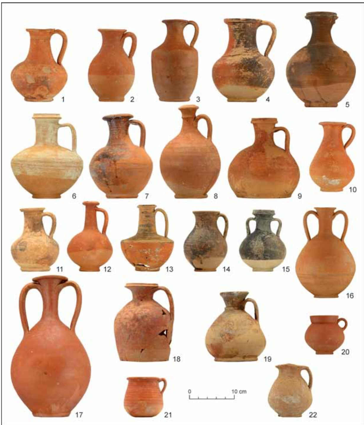
Fig. 4. The cemetery of Frontovoe 3. Red-slip pottery (pitchers, mugs, table amphorae, oenochoes). 1 – grave 183; 2 – grave 287; 3 – grave 5; 4 – grave 329; 5 – grave 201; 6 – grave 329; 7 – grave 79; 8 – grave 205; 9 – grave 313; 10 – grave 243; 11 – grave 293; 12 – grave 328; 13 – grave 162; 14 – grave 192; 15 – grave 292; 16 – grave 318; 17 – grave 300; 18 – grave 158; 19 – grave 96; 20 – grave 280; 21 – grave 108; 22 – grave 322.

Zhuravlev 2010, 23). If one accepts this attribution anyway, the said vessels would mark the graves from the late 1 st to the first half of the 2 nd c., meeting the spatial structure of the cemetery of Frontovoe 3. The graves from period 1 and the transition period contained four red-clay wheel-made vessels with no slip covering: two unguentaria and two pitchers of various forms. In period 2, there were a gray-clay bowl and a pitcher with dark-gray surface.