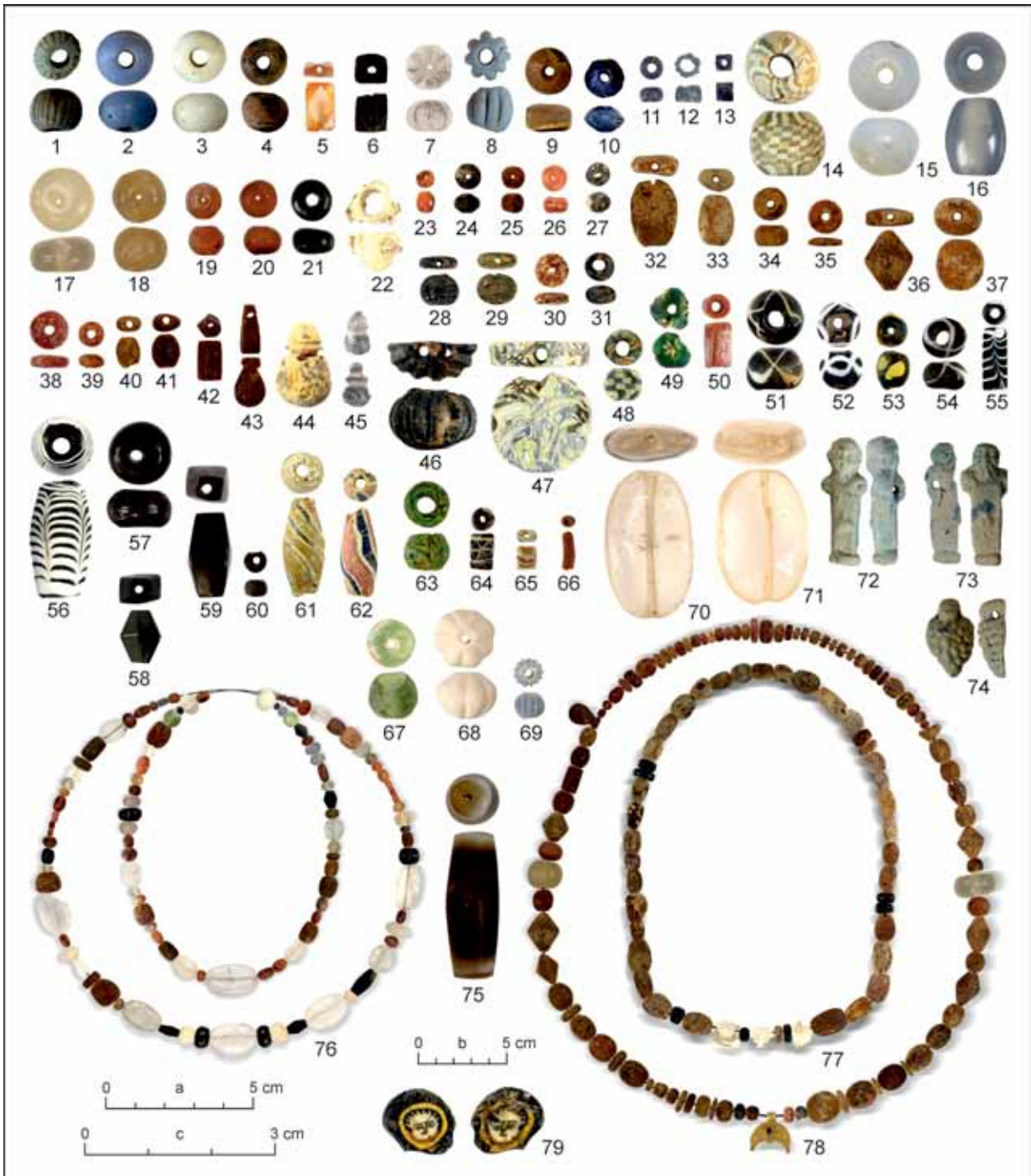
Fig. 8. The cemetery of Frontovoe 3. Beads and necklaces. 1–4 – grave 33; 5 – grave 89; 6, 7 – grave 327; 8 – grave 31; 9, 10 – grave 13; 11–13 – grave 174; 14, 15 – grave 63; 17–20, 23–27, 34–43, 78 – grave 300; 21 – grave 287; 22 – grave 236; 28–31 – grave 95; 32, 33 – grave 236; 44 – grave 22; 45 – grave 327; 46 – grave 19; 47 – grave 123; 48–50 – grave 128; 51, 55, 56 – grave 8; 52 – grave 59; 53 – grave 96; 54 – grave 236; 57–60, 67–71, 76 – grave 205; 61, 62 – grave 318; 63 – grave 238; 64 – grave 123; 65, 66 – grave 202; 72–74 – grave 327; 75 – grave 325; 77 – grave 236; 79 – grave 75. Scale: a – 1–75; b – 76–78; c – 79.