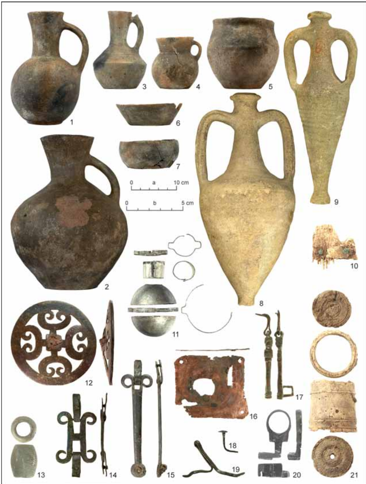
Fig. 6. The cemetery of Frontovoe 3. Hand-made vessels (1–7), amphorae (8, 9), comb (10), bottle fragments (11), clip bead (13), horse bridle parts (12, 14, 15), casket fragments and keys (16–20), pyxis (21). 1 – grave 52; 2 – grave 205; 3 – grave 137; 4 – grave 154; 5 – grave 52; 6 – grave 178; 7 – grave 96; 8 – grave 170; 9 – grave 136; 10 – grave 6; 11 – grave 106; 12, 14, 15 – grave 319; 13 – grave 41; 16–19 – grave 151; 20 – grave 232; 21 – grave 322. Scale: a – 1–9; b – 10–21.