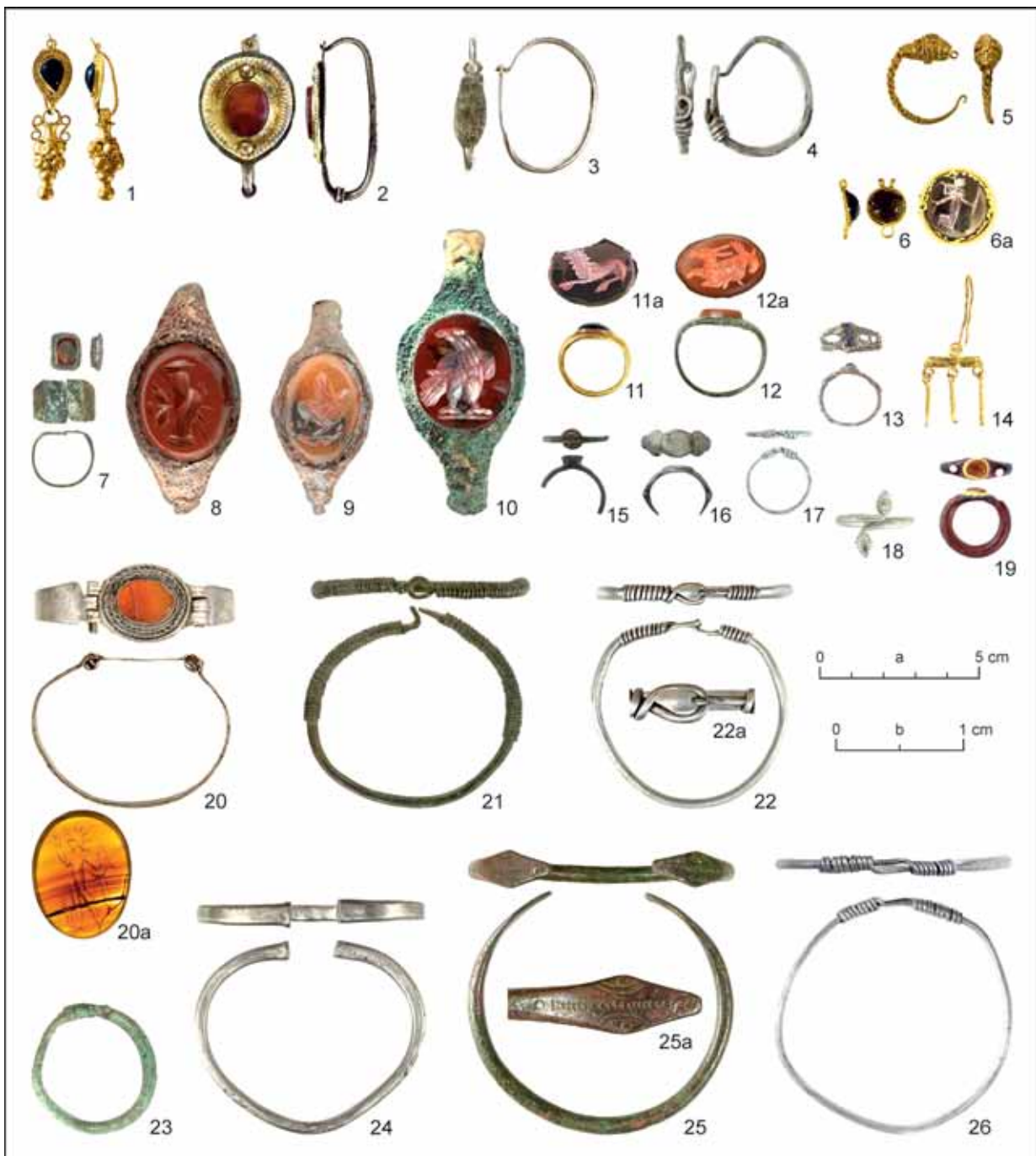
Fig. 10. The cemetery of Frontovoe 3. Earrings, finger-rings, bracelets. 1 – grave 136; 2 – grave 16; 3 – grave 13; 4 – grave 27; 5, 6 – grave 312; 7 – grave 3; 8, 9 – grave 232; 10 – grave 60; 11 – grave 300; 12 – grave 184; 13 – grave 234; 14 – grave 320; 15 – grave 154; 16 – grave 33; 17 – grave 158; 18, 21 – grave 21; 19 – grave 230; 20 – grave 145; 22 – grave 85; 23 – grave 78; 24 – grave 17; 25 – grave 234; 26 – grave 75. Scale: a – 1–7, 11–26; b – 8–10.

things which were fastened to the rods of these earrings remain unknown. The second pair has braided loop with a bulge in the form of lion's head (Fig. 10: 5). Their lock possesses a disk-shaped appendage (Fig. 10: 6) with a convex inset, one decorated with incised image of a stepping figure wearing long cloths and holding a spear and a shield (Fig. 10: 6a). The earrings with a bulge shaped like lion's head reveal the continuation of the Hellenistic tradition in the Early Roman period. The third pair of earrings (grave 300) resembles the second, though it does not have the ending in the form of lion's head and disk-shaped appendage to the lock.